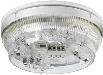
MASB870 sounder beacon base