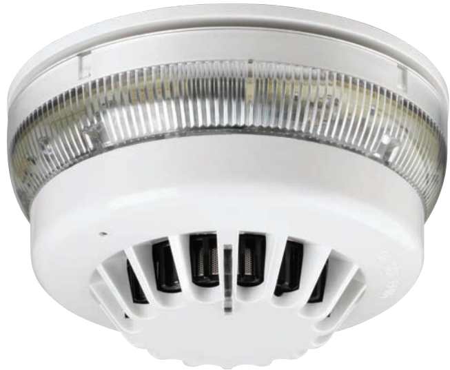
MASB870 with sensor fitted